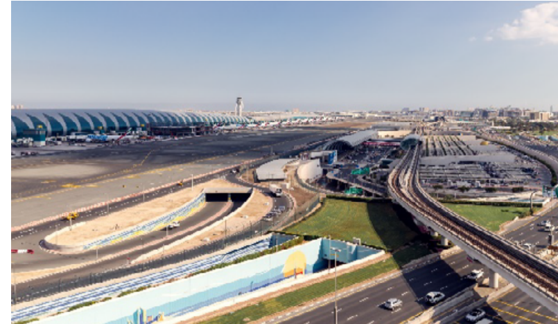
Dubai International Airport, United Arab Emirates

Honeywell empowers airports worldwide to reach optimized operational potential.