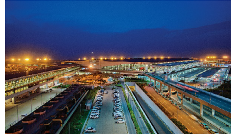
Indira Gandhi Airport, Delhi, India