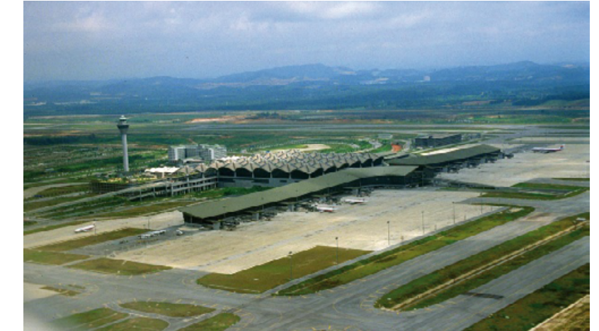
Kuala Lumpur International Airport, Malaysia