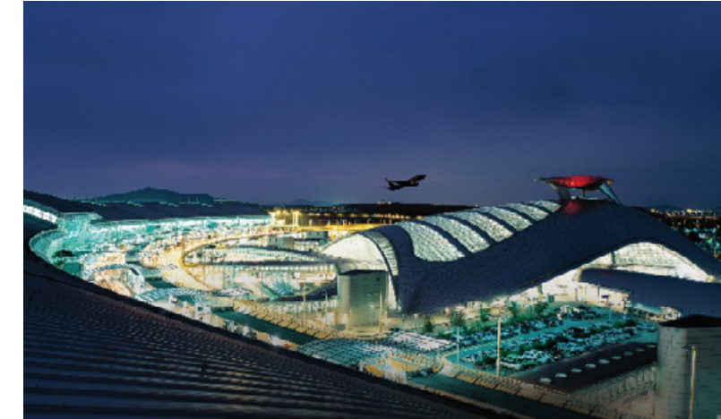
Incheon International Airport, South Korea